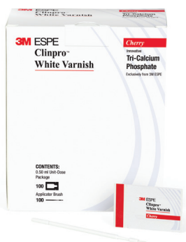
Pack size 100