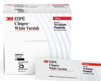
Pack size 50

Apply Clinpro White Varnish with TCP evenly in a thin layer over treatment area(s) with sweeping, horizontal brush strokes. No suction required.