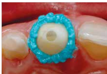
Applied VOCO Retraction Paste